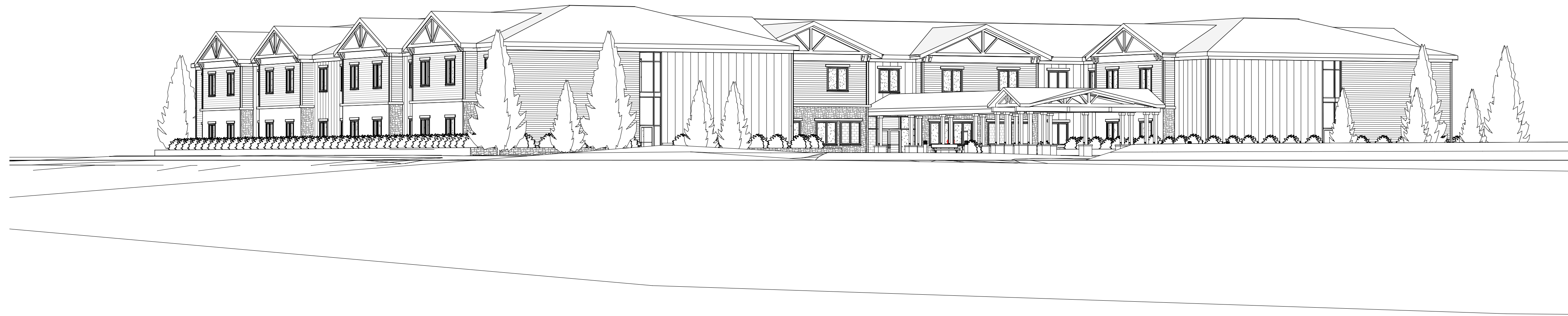
② 3D View 5