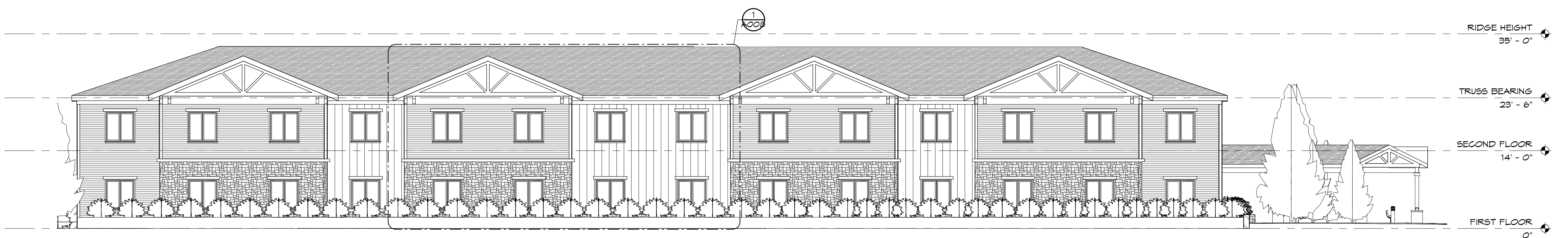
④ SIDE ELEVATION 1 3/32" = 1'-0"