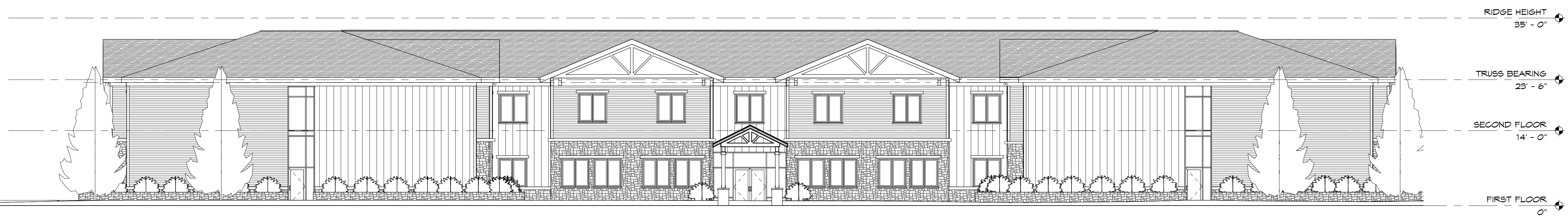
① FRONT ELEVATION 3/32" = 1'-0"