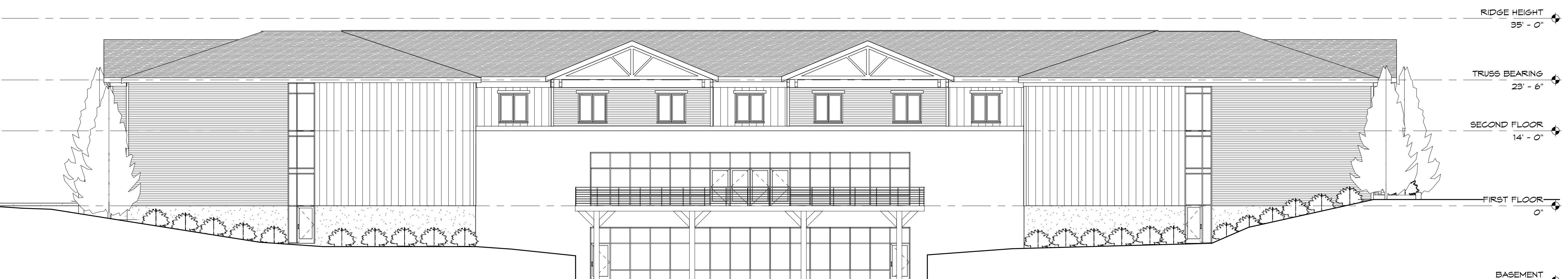
② REAR ELEVATION 3/32" = 1'-0"