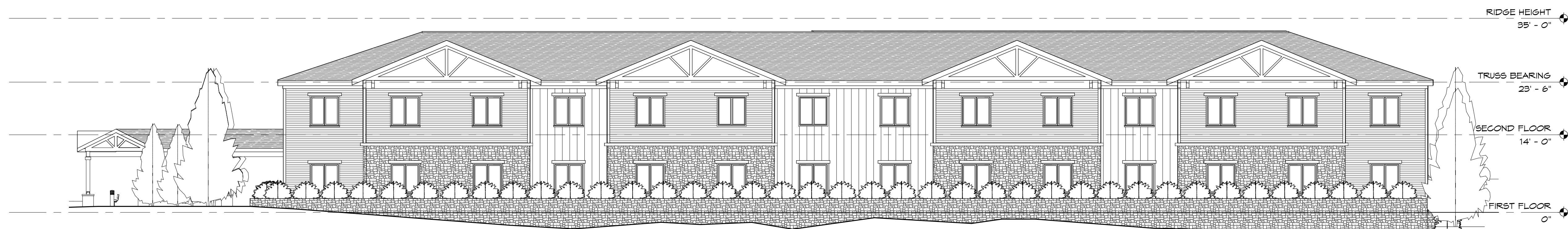
③ SIDE ELEVATION 2 3/32" = 1'-0"