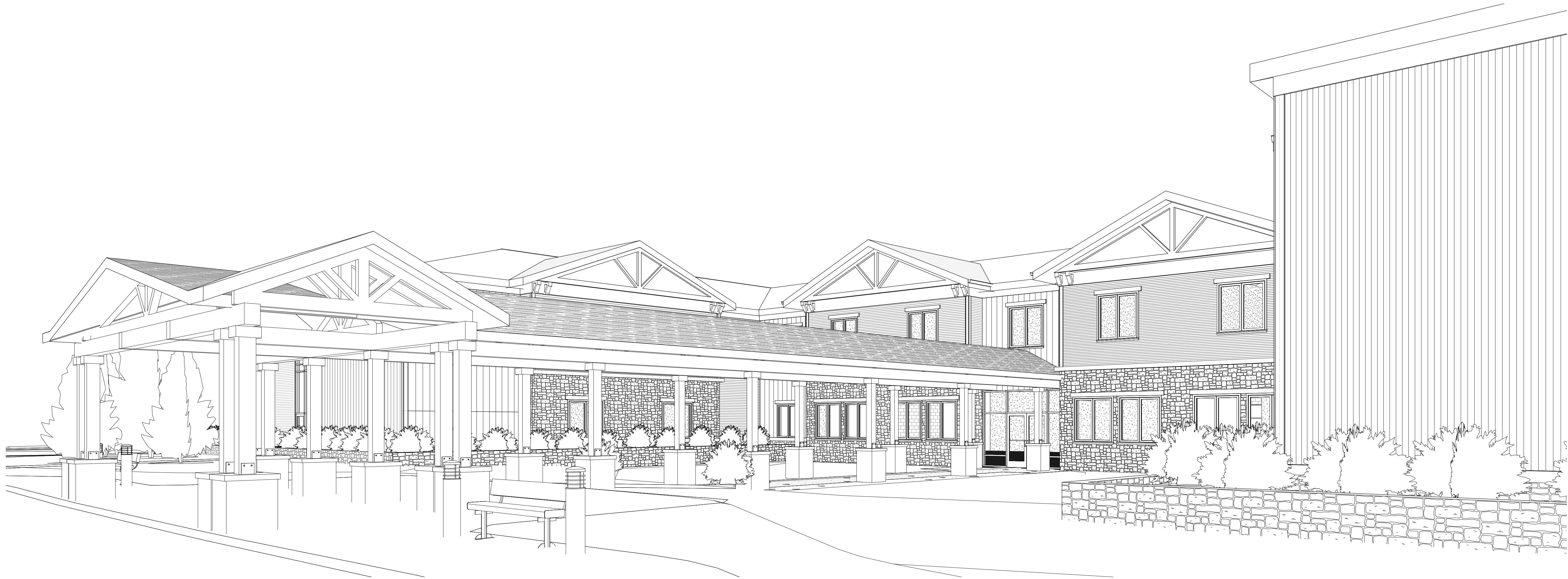
② 3D View 2