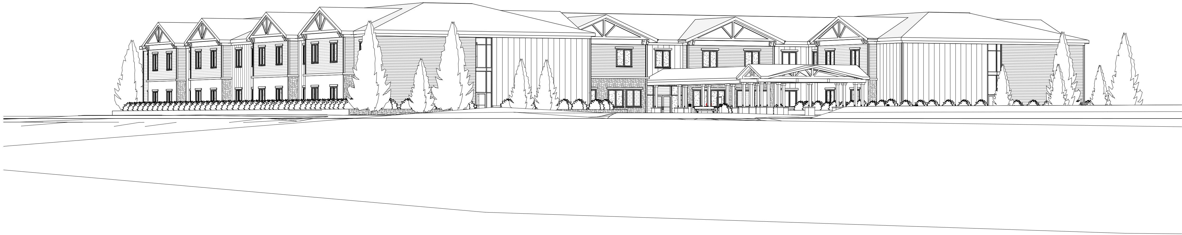
② 3D View 5