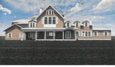
6 Proposed Residence SCALE: 1/8" = 1'-0"