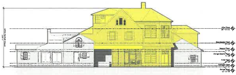
3 Zoning East Elevation SCALE: 1/8" = 1'-0"