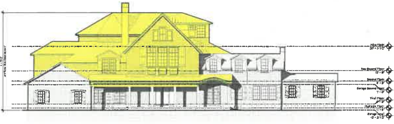
1 Zoning West Elevation SCALE: 1/8" = 1'-0"