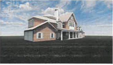
7 Proposed Residence SCALE: 1/8" = 1'-0"