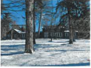
5 Existing Residence SCALE: 1/8" = 1'-0"