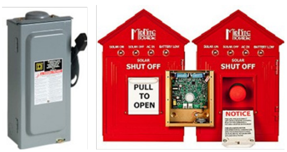
BOS Components: A Square D Fusible AC Disconnect (left) and a MidNite Solar Rapid Shutdown Device (right)

"Balance of system" (BOS) generally refers to all equipment in a solar PV installation except the modules and inverter. (Occasionally, inverters are included in the term.) BOS components include racking, conductors, conduit, disconnects, fuses, mounting hardware, combiner boxes, and occasionally batteries.